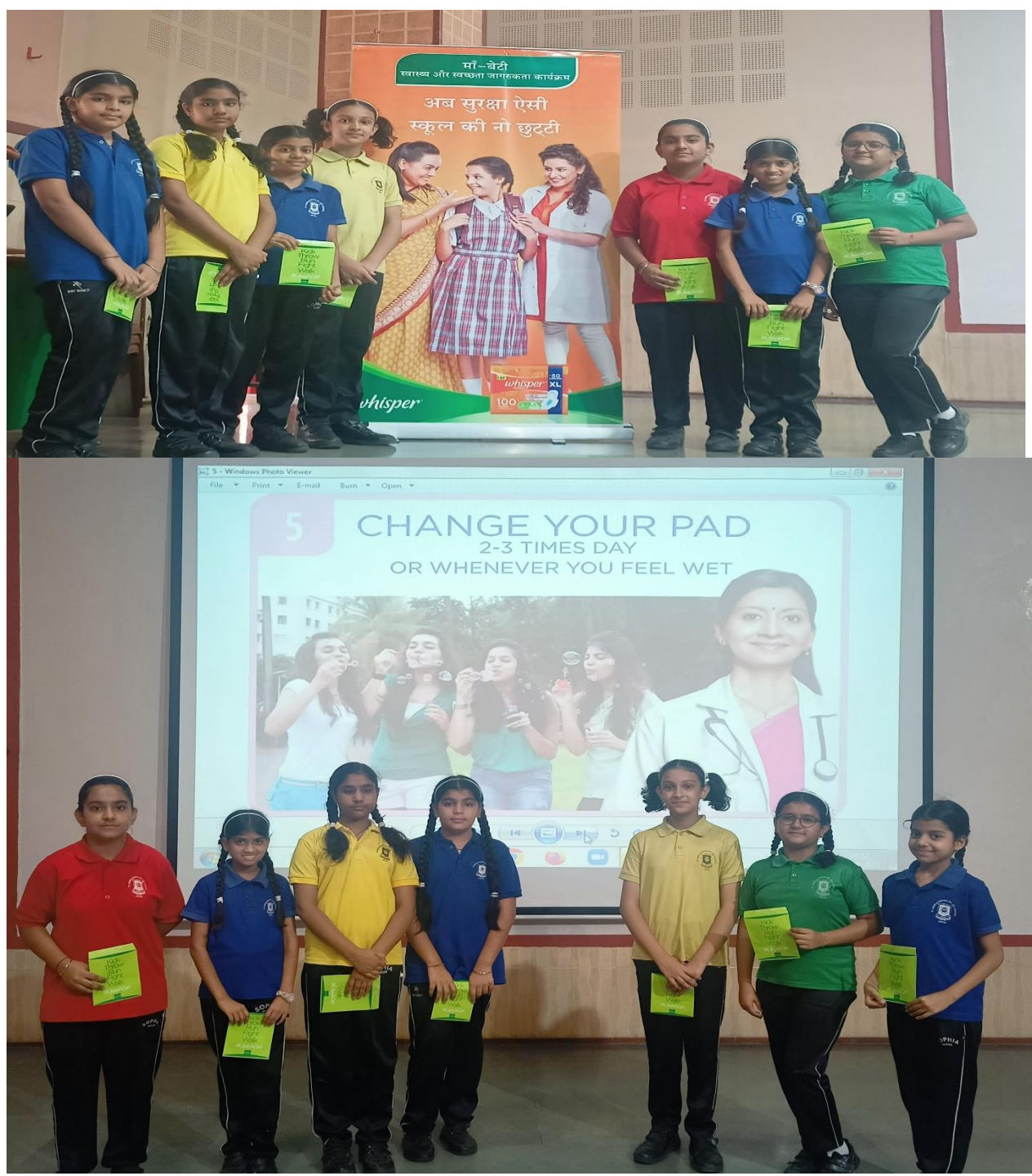
8 July 2023 Science Club Activity

enhance knowledge, and improve practices of girls on hygiene during menstruation.